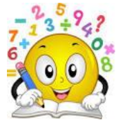
You can use a number line to help you divide too. Watch this clip to find out how a number line can be used to solve 30 ÷ 5.

Scroll down and watch the video to recall how to use a number line in division. Answer these questions using a number line in your book: